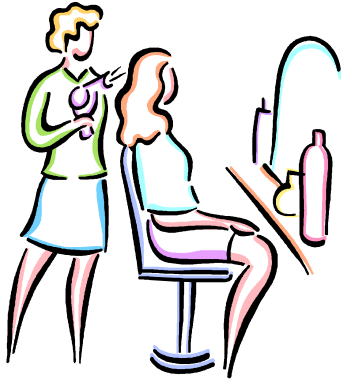
High street salon