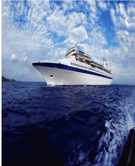
Hairdressers based on cruise liners