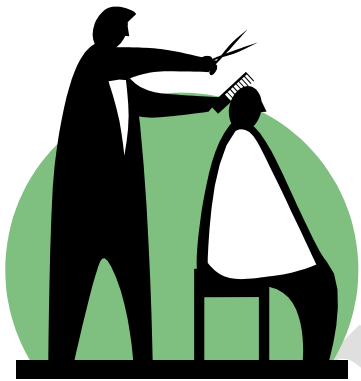
Mens hairdressing at a barber