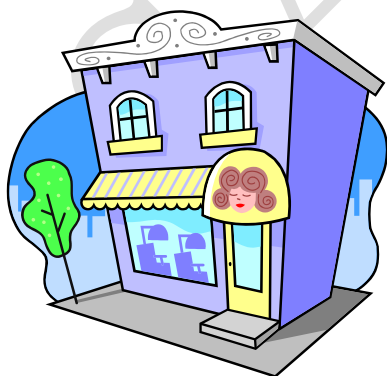
Beauty salon on the high street