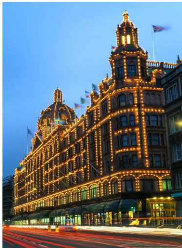
Hairdressers based in department stores