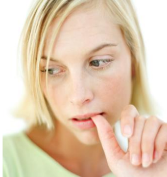
Fair skin tone

This could be answered through the use of pictures illustrating different colours e.g. skin tones, by using magazine cut-outs of different people or designing a mood board