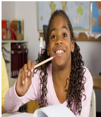
Dark skin tone